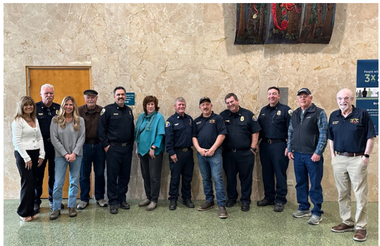
Members of the merged Fire Departments and City of Sebastopol representatives.

The Sonoma County Local Agency Formation Commission (LAFCO) conducted a public hearing Wednesday to receive any testimony from interested parties and to conclude the formal Protest Period for the proposed reorganization of Sebastopol's Fire Department with the Gold Ridge Fire Protection District. As fewer than 200 protests were received from City voters and/or property owners, Gold Ridge Fire Protection District Reorganization No.