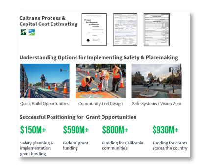
Estimating & Funding