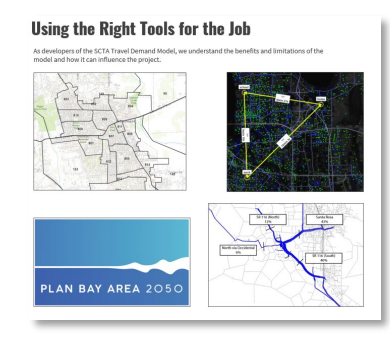
The Right Tools