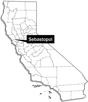
Fire Hazard Severity Zones (FHSZ) in Local Responsibility Area (LRA), as Identified by the State Fire Marshal