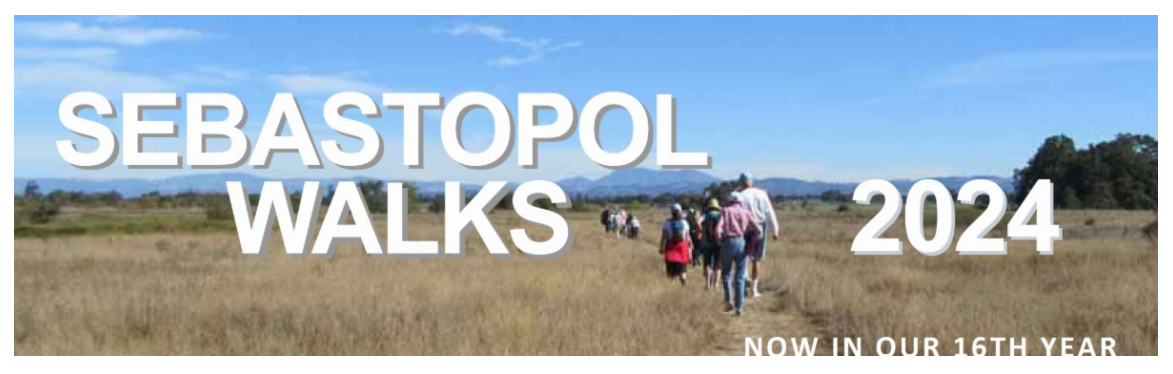
See what you've been missing from the driver's seat . . .

It's the best time of year to enjoy walking in Sebastopol! Be a tourist in your own small town and walk where you've never walked before. Most Walks are the last