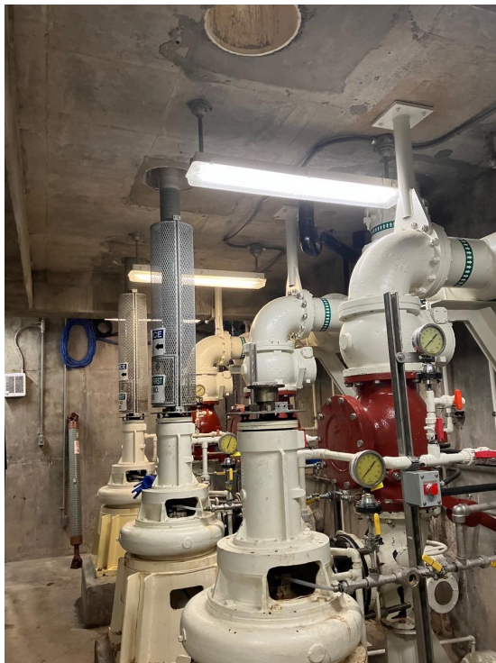
Original Sewer Pumps Installed in 2010

Significant energy efficiency and facility improvement project is nearing completion at the Sebastopol Morris Street Sewer Pump Station. The pumps at the Morris lift station had been in operation for fourteen years and were showing signs of decreased efficiency to move wastewater to the Laguna Treatment Facility. This capital improvement measure replaced the three (3) pumps and relocated them to the pump room, removing the 2-story drive shaft system that had previously been in place. The replacement of these pumps will reduce maintenance, increase the reliability of the system, and improve pumping efficiency.