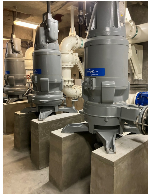
New Upgraded Sewer Pumps