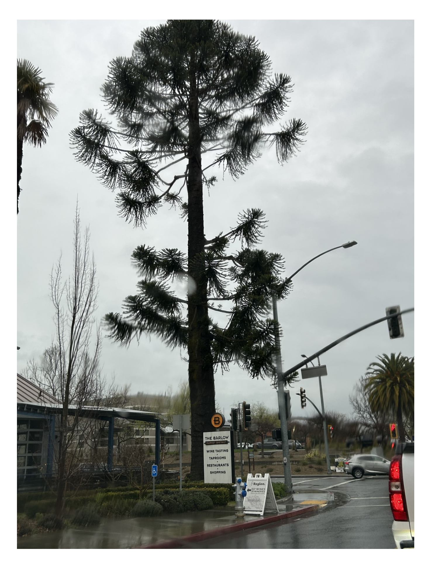
My submitted comment: