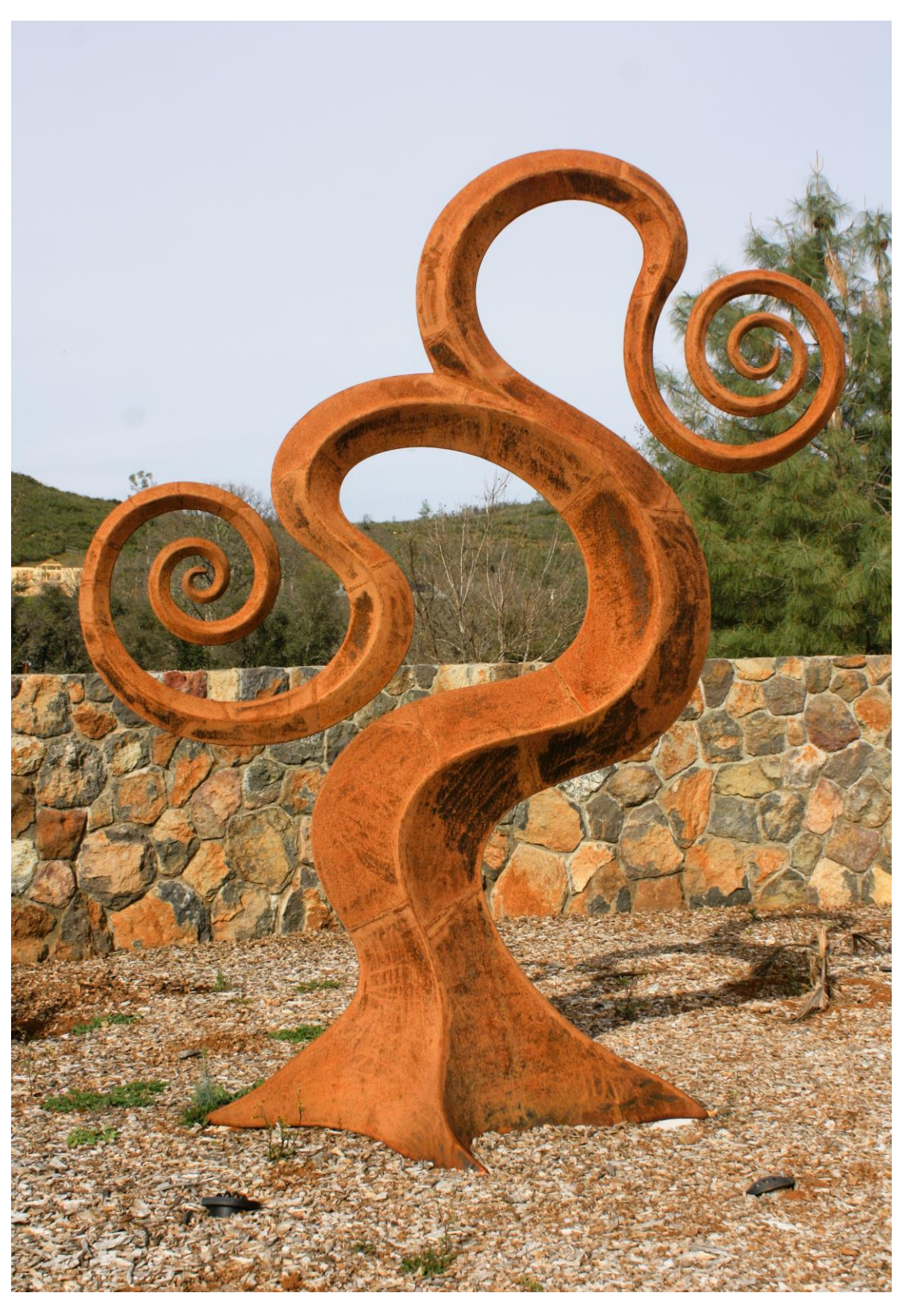
This piece is titled "New Seedling". It's publicly displayed in Hidden Valley Ca. It really shows off the corten patina.