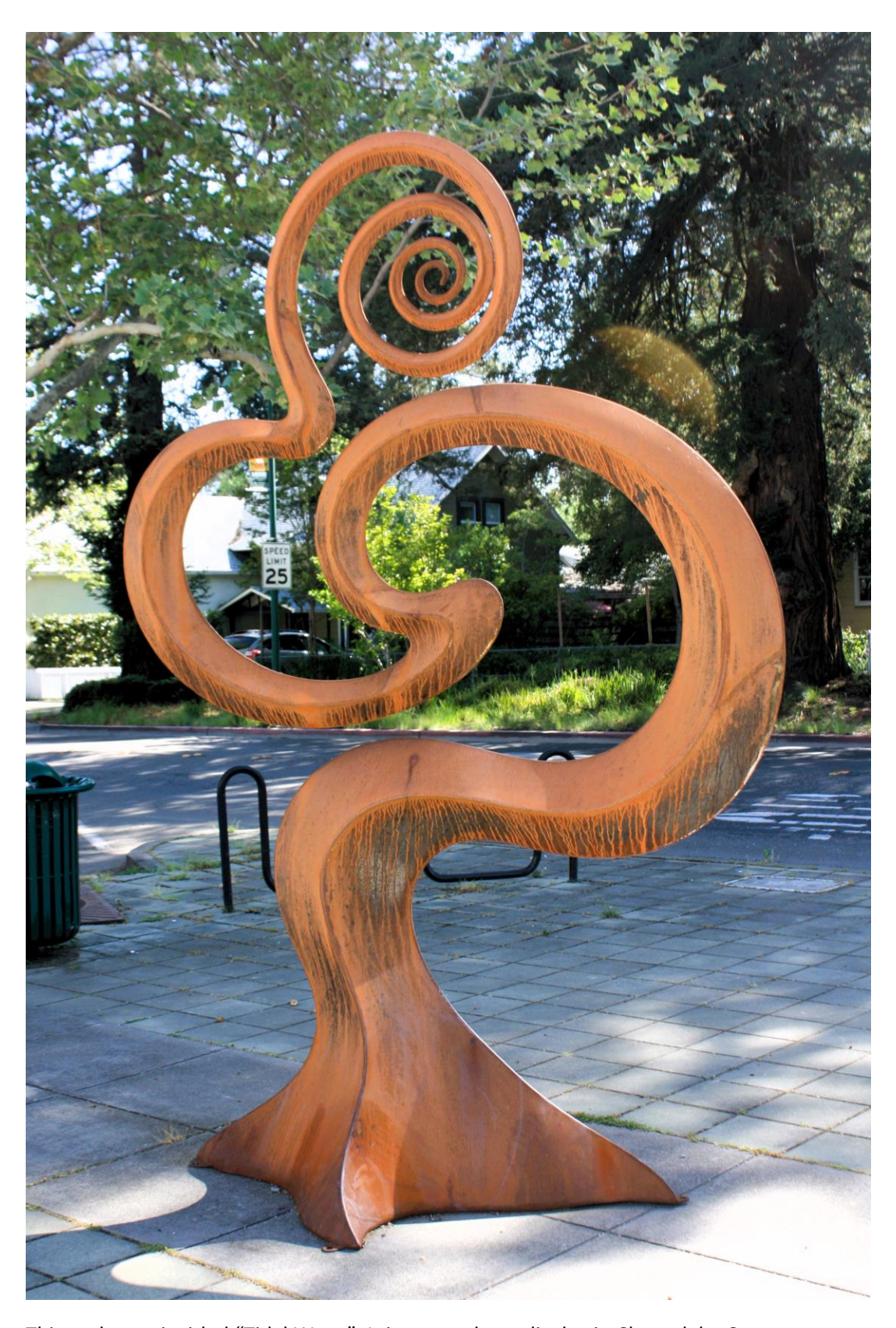
This sculpture is titled "Tidal Wave". It is currently on display in Cloverdale, Ca.