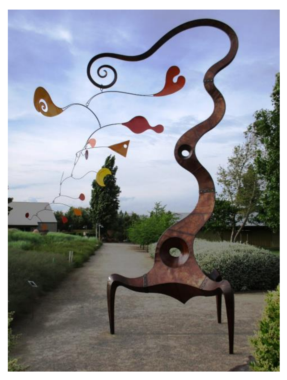
This is a large Mobile sculpture that was on public view for a time in both Middletown Ca. and at Cornerstone Sonoma. It is about 22 feet tall and has a mobile element that is attached to the top. It is now in Sacramento at a private residence On Freeport Ave. It is still publicly viewable though.