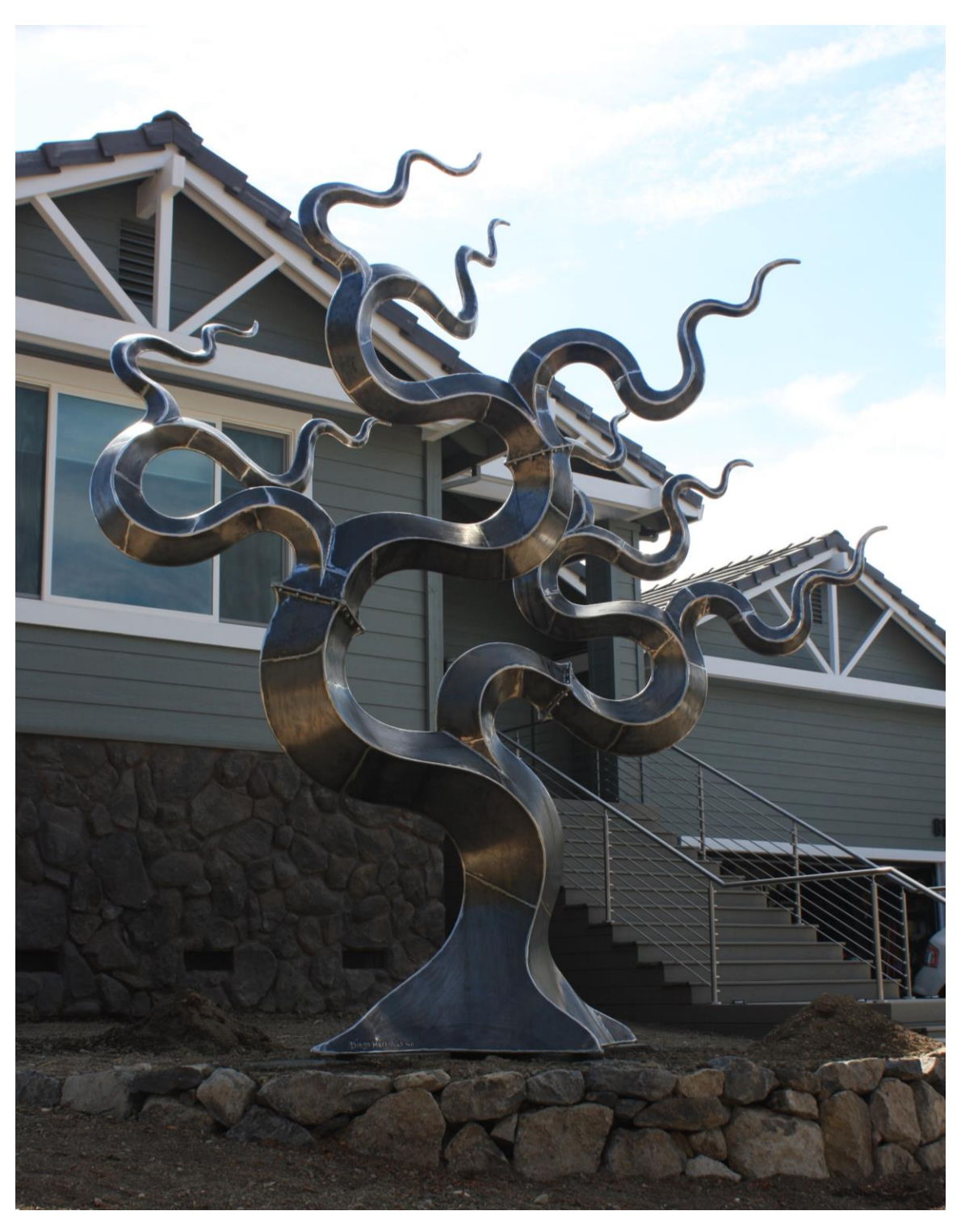
This piece is in Healdsburg Ca. It is located at a private residence but can be viewed from the street at Borel Rd.