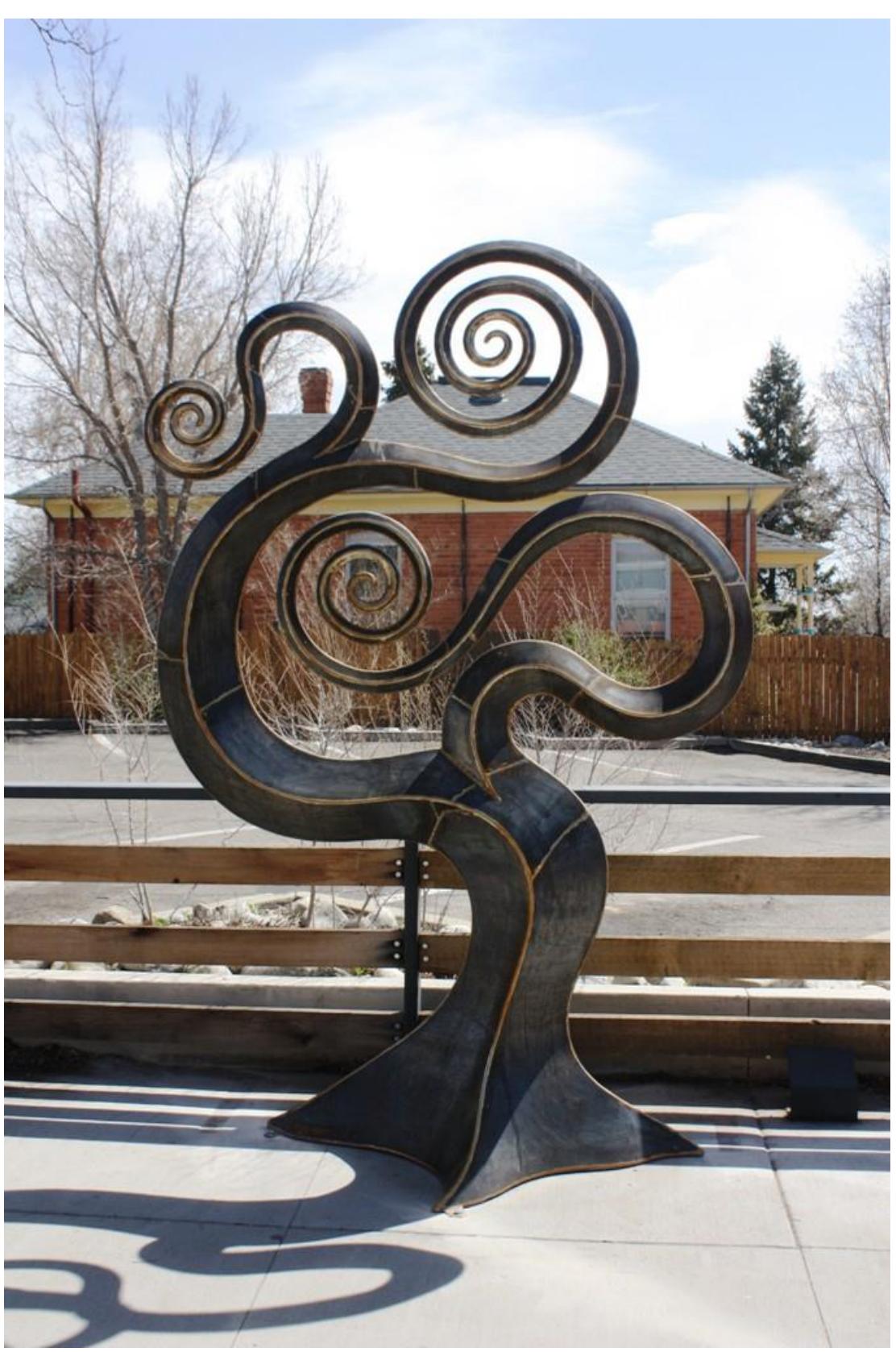
This sculpture is titled "Trinity" and it is on display in the town of Lafayette Co. as part of their collection.