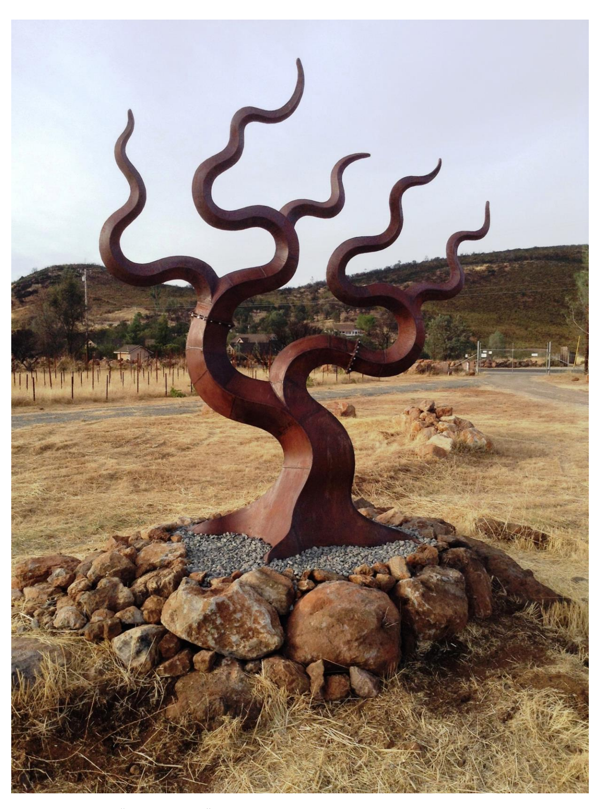
This piece is titled "Rust Fire Tree". It is now privately owned in Middletown Ca.