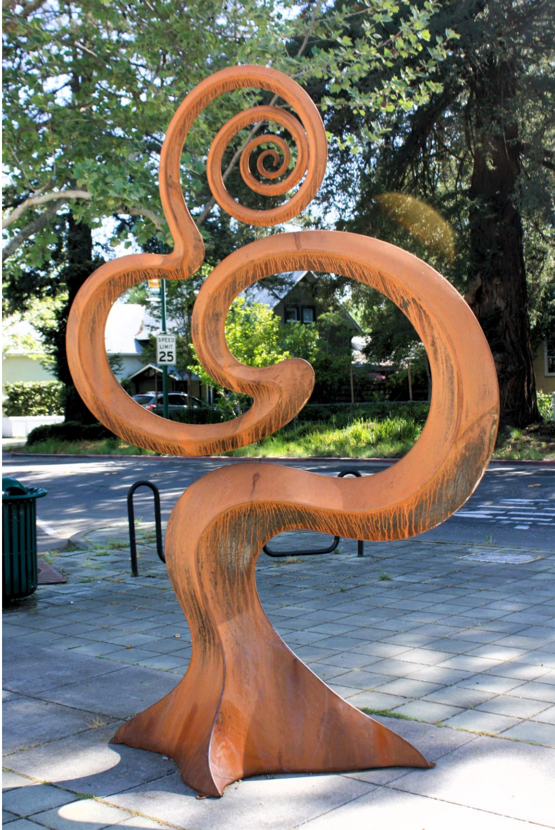
This sculpture is titled "Tidal Wave". It is currently on display in Cloverdale, Ca.