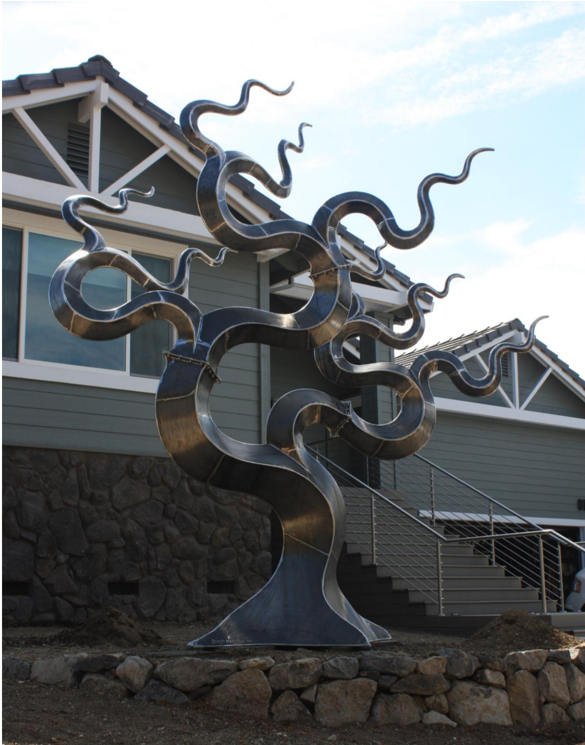
This piece is in Healdsburg Ca. It is located at a private residence but can be viewed from the street at Borel Rd.