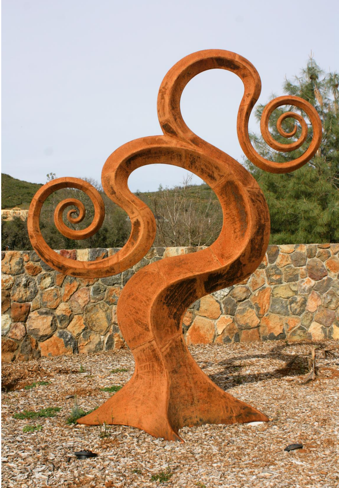
This piece is titled "New Seedling". It's publicly displayed in Hidden Valley Ca. It really shows off the corten patina.