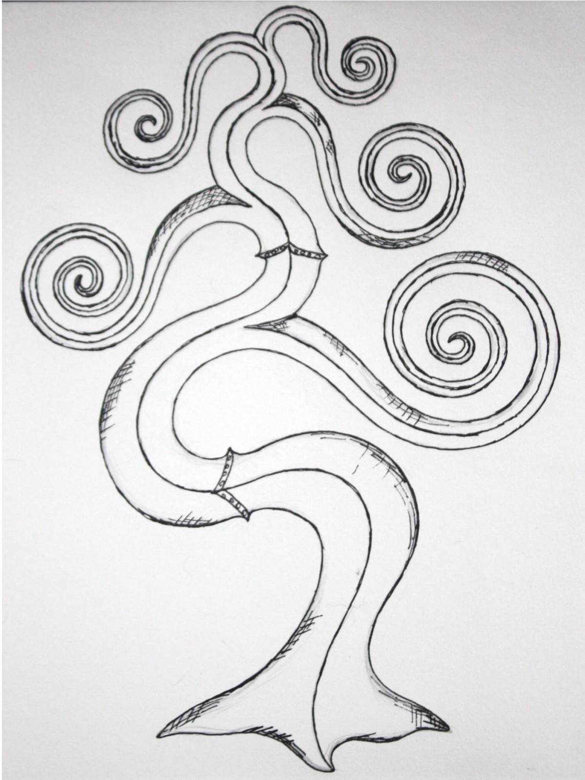
Proposed sculpture Drawing.