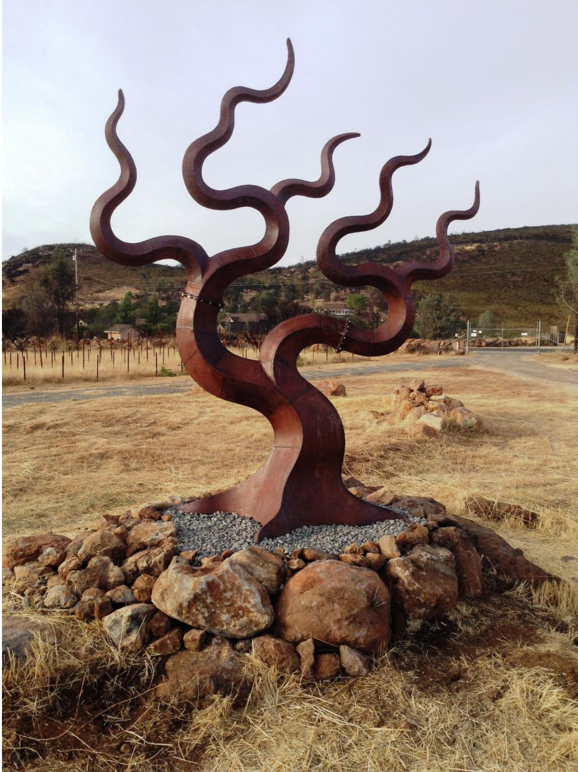
This piece is titled "Rust Fire Tree". It is now privately owned in Middletown Ca.