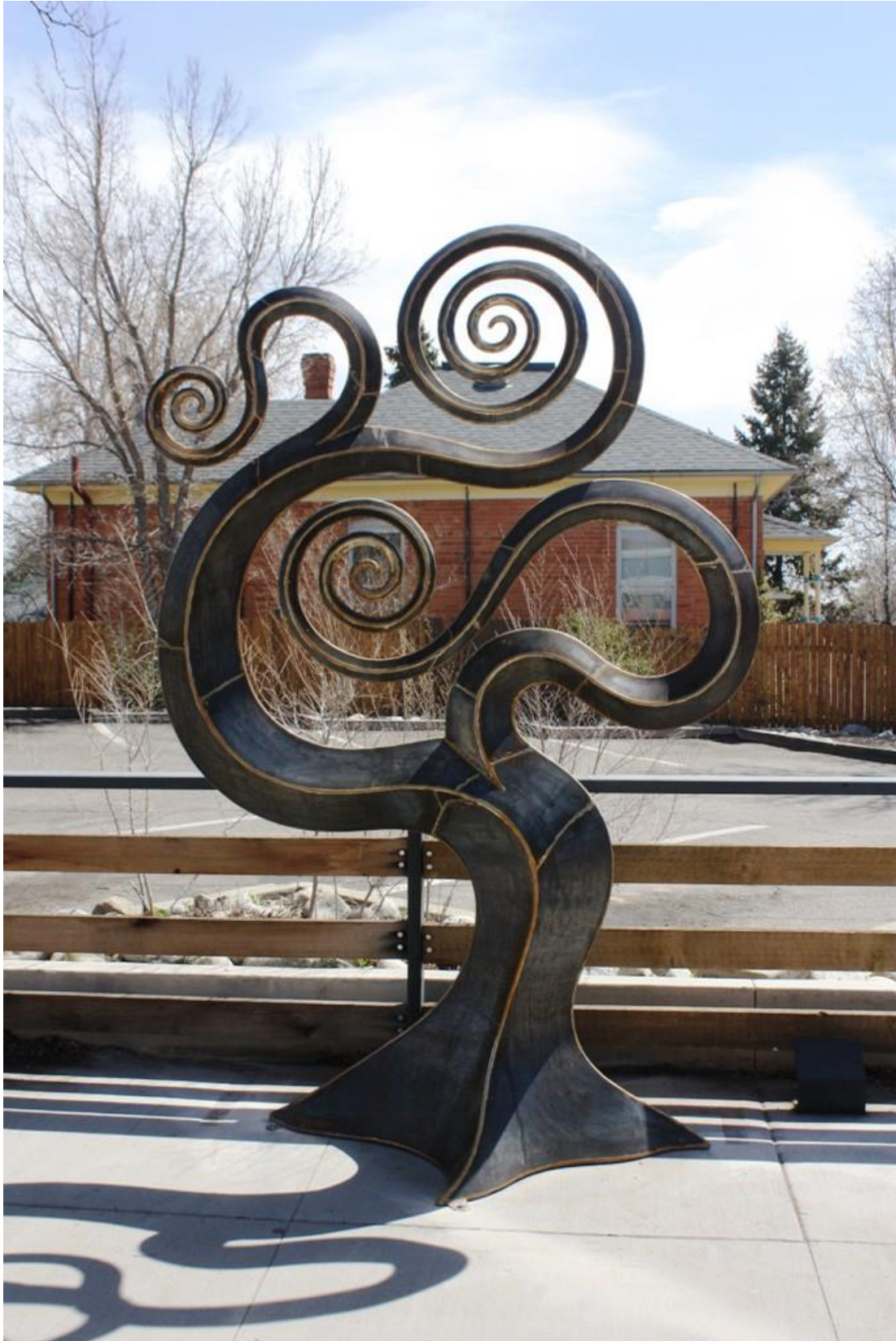
This sculpture is titled "Trinity" and it is on display in the town of Lafayette Co. as part of their collection.