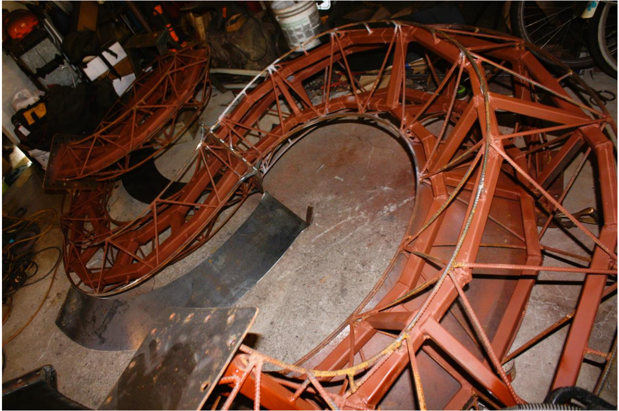
Here is a photo of the internal structure of one of my sculptures. This is before I add the corten steel sheeting. You can see one of the panels in the middle left of the photo before it is welded on.