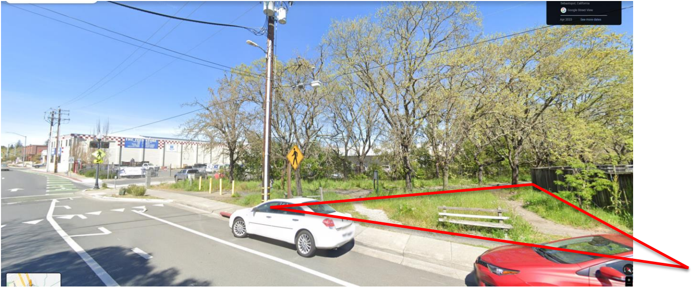
Petaluma Avenue facing east t to site