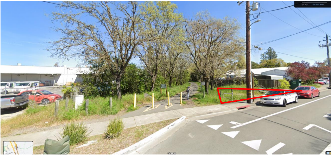
Petaluma Avenue facing east to site