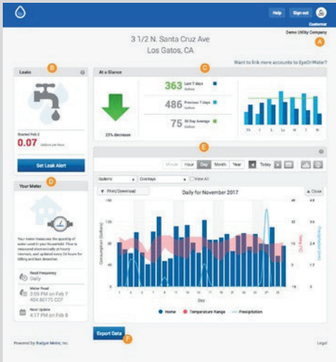
A Welcome | B Leaks | C At a Glance D Your Meter | E Consumption Graph F Export Data

After sign in, EyeOnWater lets you see how much water you’re using and provides tools to help you use water more efficiently. The site acts like dashboard that is organized in modules or sections that let you quickly see how much water you’re using, whether you have a potential leak, and more.