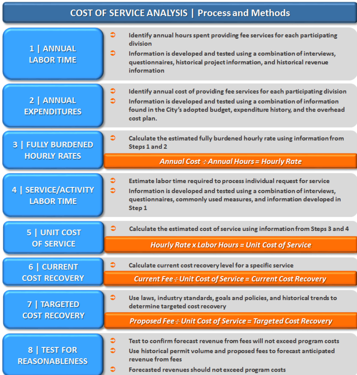
EXHIBIT 4 | STEPS IN ANALYZING COSTS OF SERVICE AND USER FEES

An illustration of the methods used in this analysis is shown below.