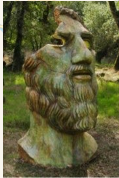
Graton Gallery 9048 Graton Rd, Graton (707) 829-8912 Zeus