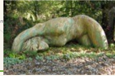
Starlite Winery 5511 Ca128 Geyserville (650)464-7154 Persephone 2