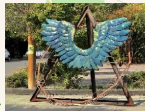
Geyserville: Sculpture Field 21140 Redwood Highway