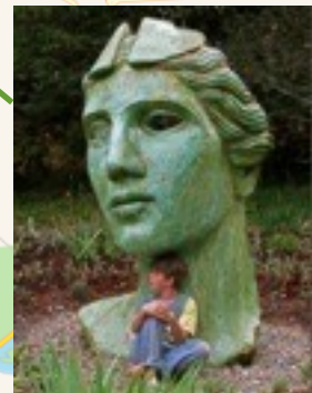
COTATI City Center ATHENA