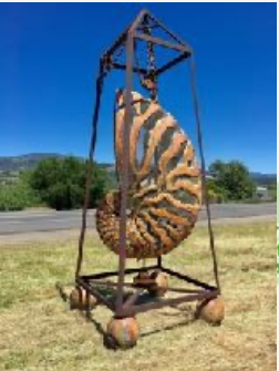
Moshin Winery 10295 Westside Road Healdsburg (707) 433-5499 Wing Obelisk