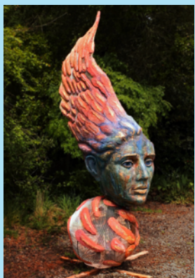
OLEMA COTTAGES 9970 Sir Francis Drake Blvd. Olema, CA (415) 663-1288 HYPNOS