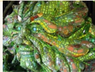
Hammerfriar Gallery 132 Mill Street #101 Healdsburg (707) 473-9600 Many Sculptures