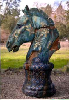
CLOVERDALE S. Cloverdale Blvd. & E. 2nd Navigator