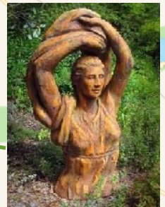
PARADISE RIDGE WINERY Thomas lake Harris Rd Santa Rosa,