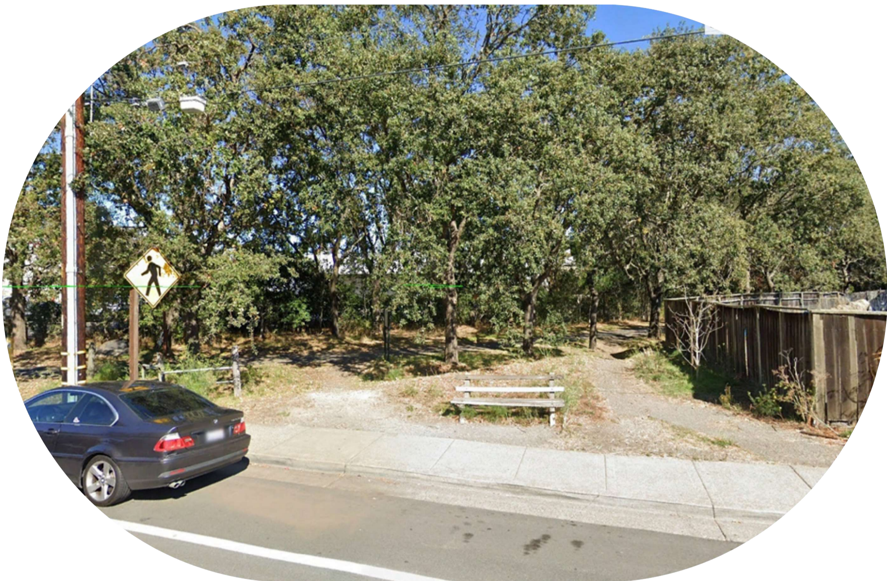
South Entry of the Joe Rodota Trail (Sebastopol, CA)