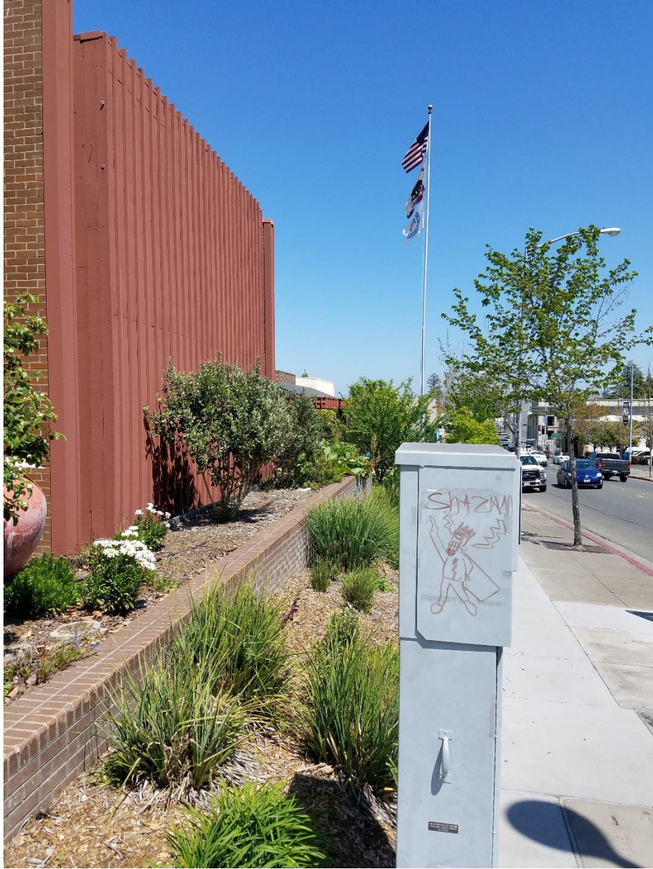
Looking east along Bodega Avenue frontage, utility box in foreground