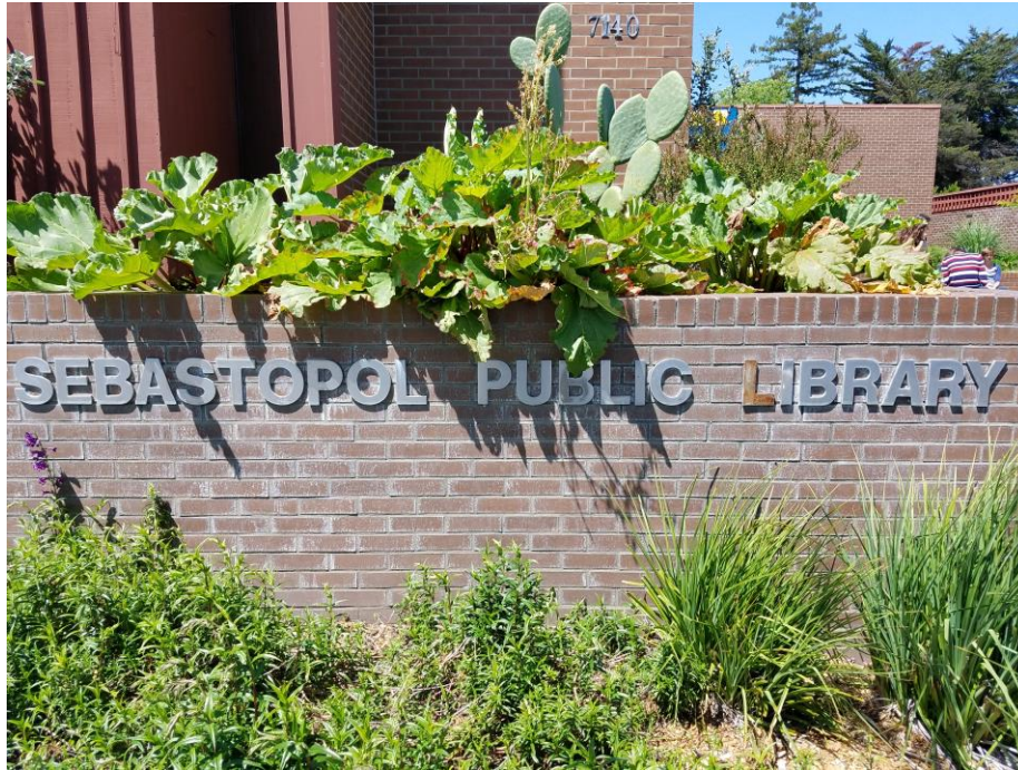
Bodega Avenue frontage