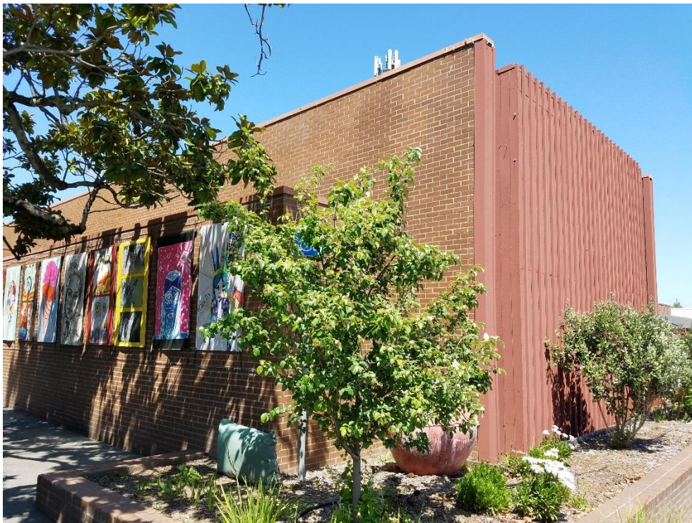
West-facing wall of Forum Room, corner of Bodega Avenue/High Street