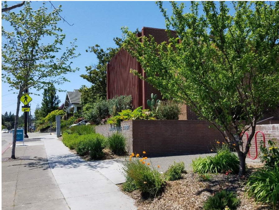
Looking west along Bodega Avenue