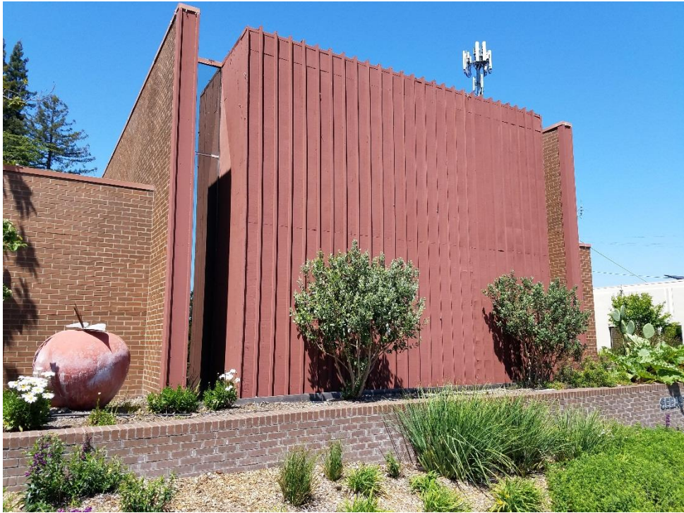
Project site wall; note retaining wall, landscaping