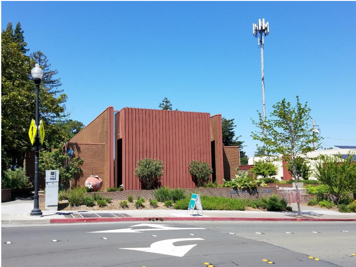
South-facing Library Forum Room wall, project site