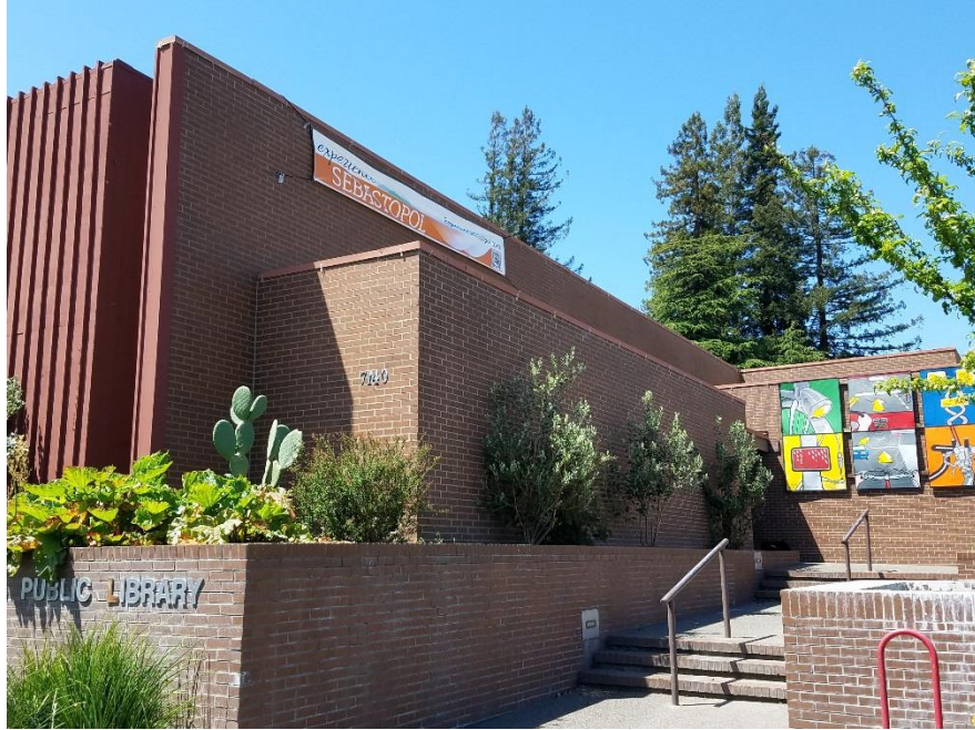
Easterly Library entry area