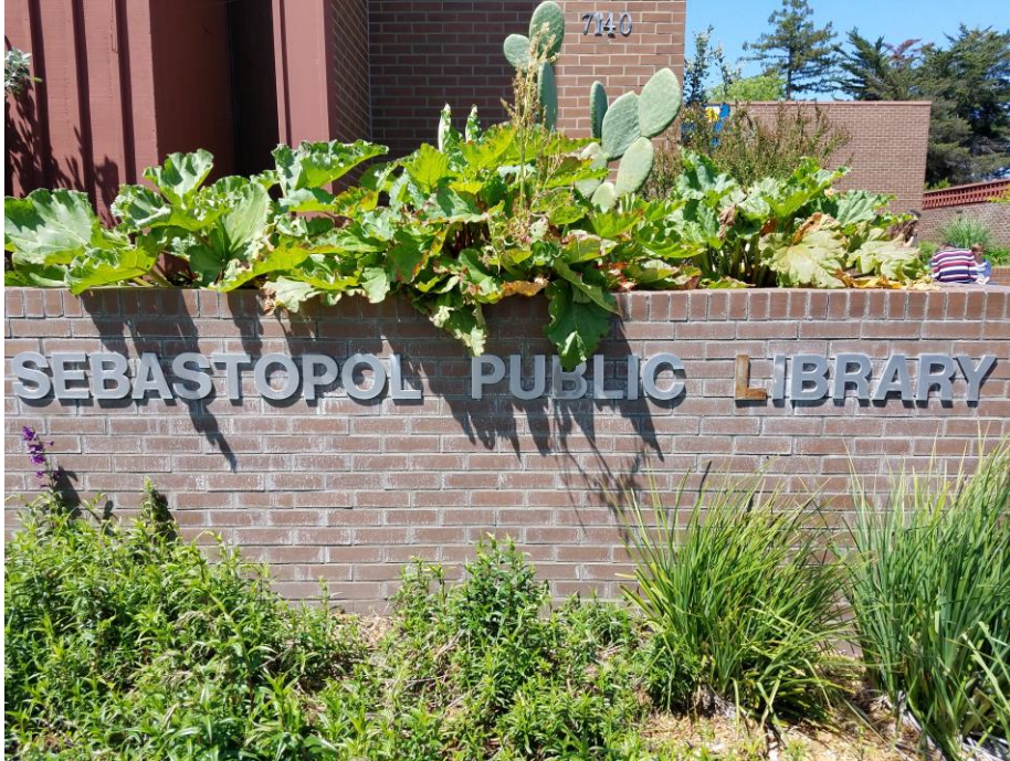
Bodega Avenue frontage