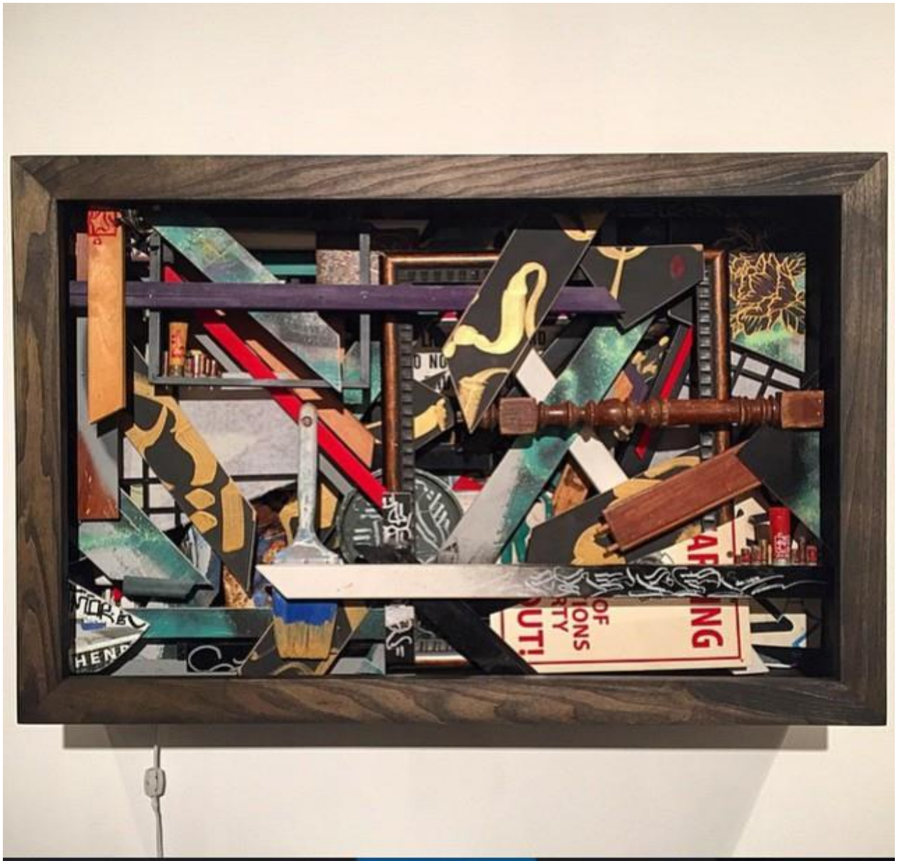
FOUND OBJECT LIGHTBOX 1