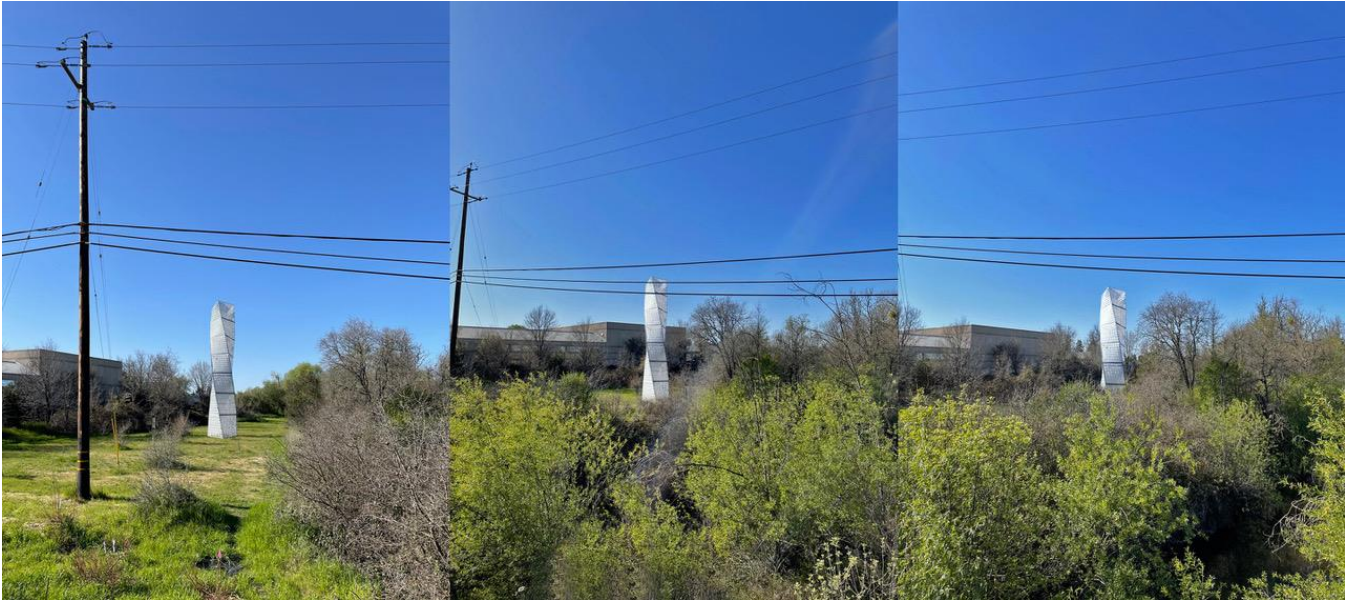
View of Column from Highway 12/Sebastopol Avenue coming into the City