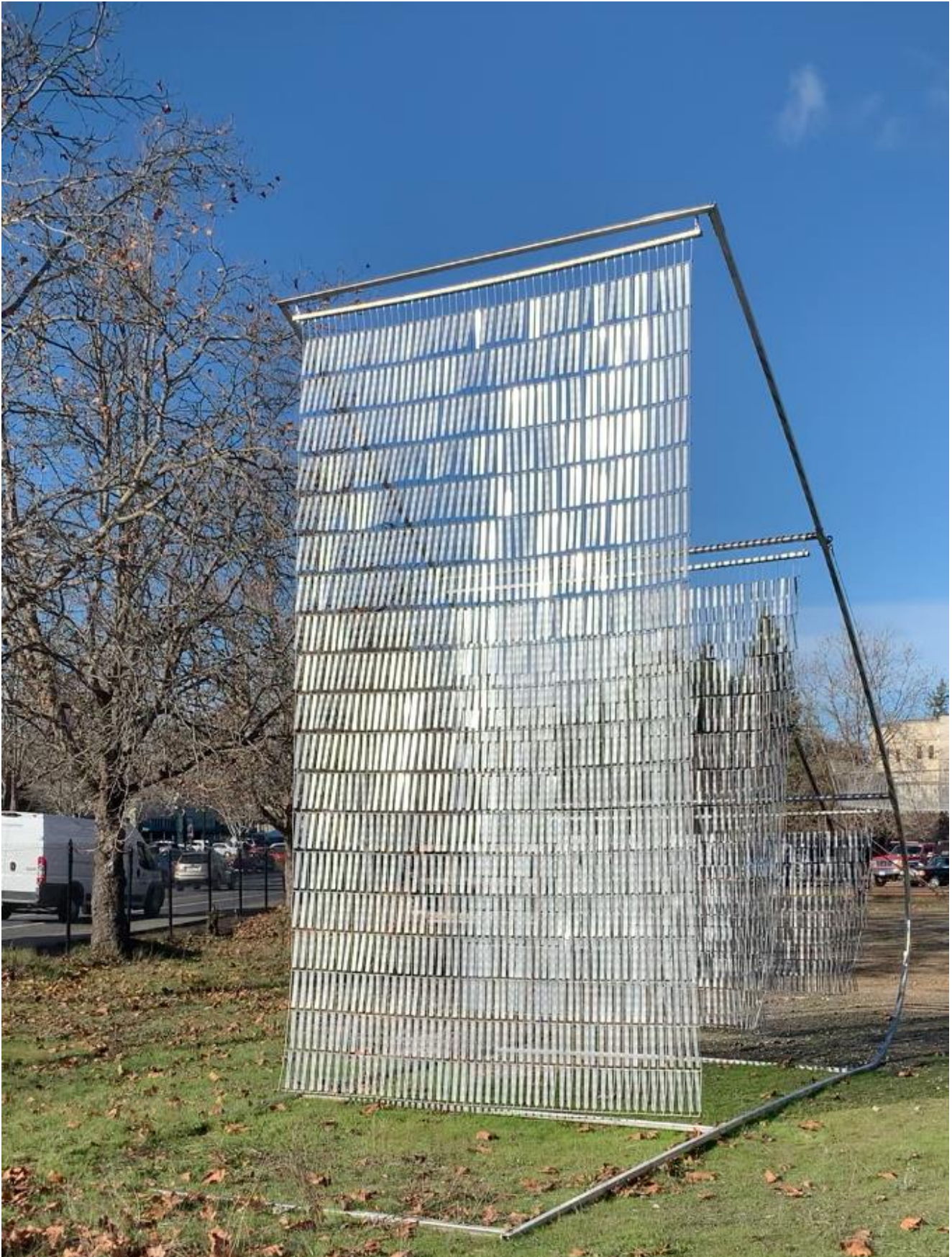
Similar Materials at Hotel Sebastopol Site installation