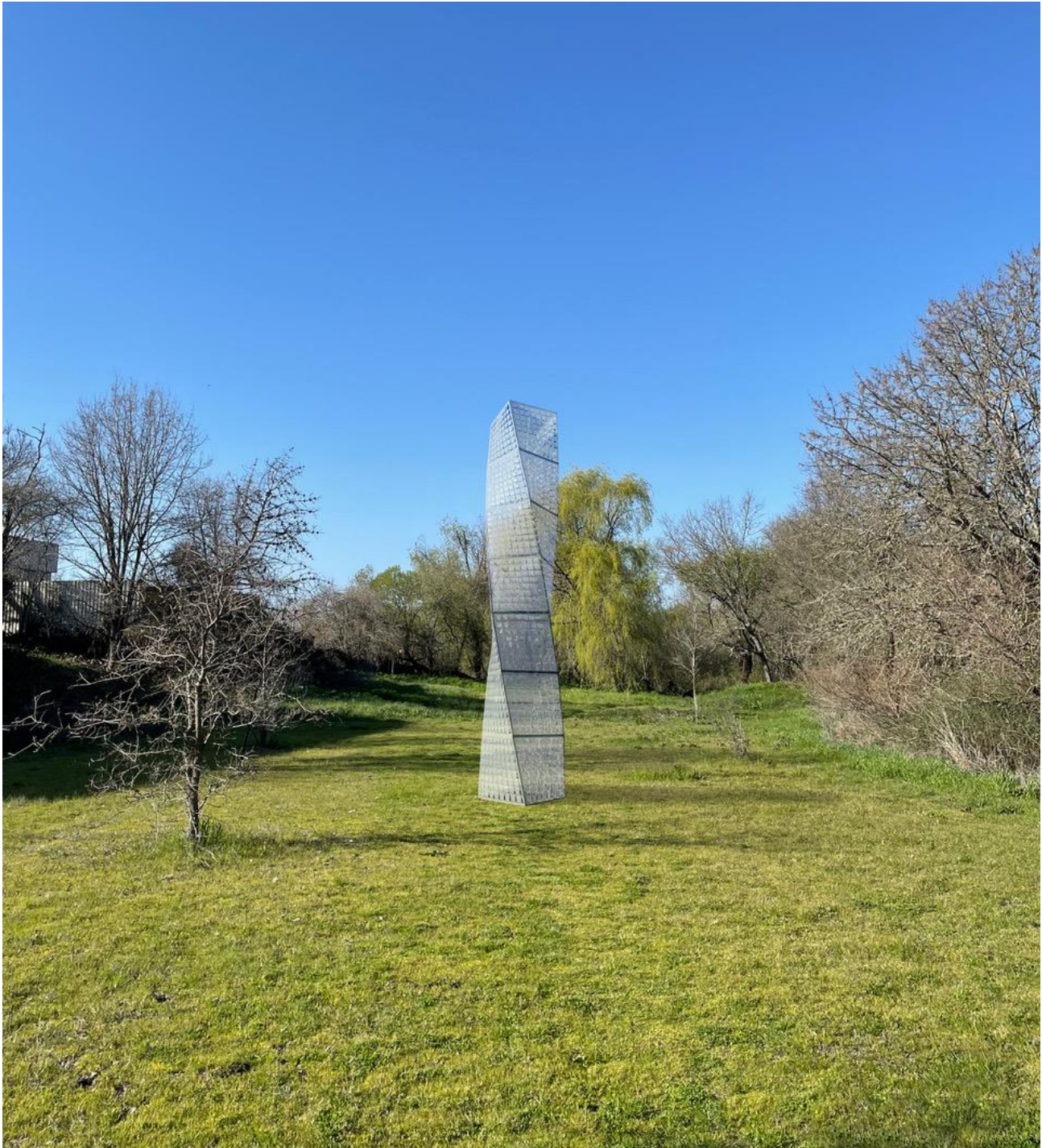
View of Sculpture looking north from Sebastopol Avenue (Trail will be along west side of meadow area)