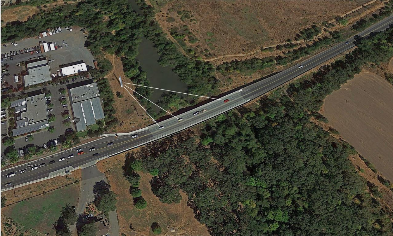
Aerial Rendering and Key to where views of column in below images are taken