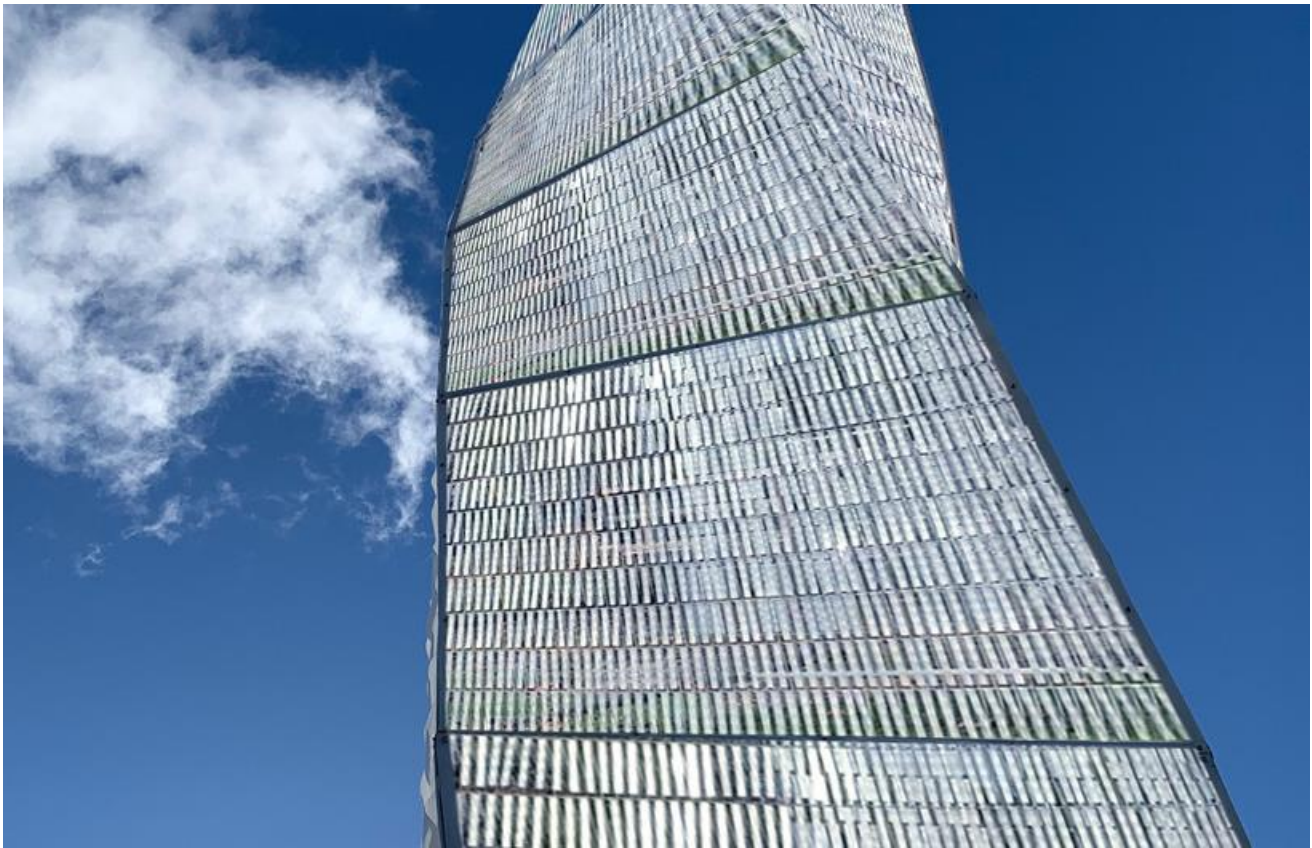
Detail of Column