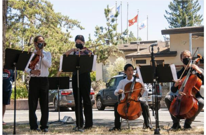
Santa Rosa Symphony Youth Chamber Music Ensemble