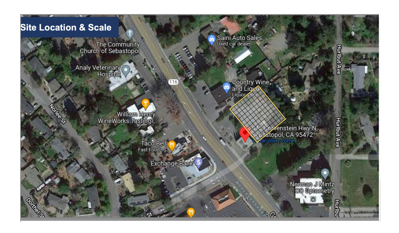
Site Location – 845 Gravenstein Highway North, Sebastopol