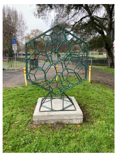
Medallion Artist: Briona Hendren

The Sebastopol City Council and its Public Arts Committee (PAC) invite Sonoma County-based artists to submit proposals for the new Community Sculpture Garden (CSG) located along the pedestrian walk between Ives Park's Calder Creek and the Sebastopol Center for the Arts. The CSG will eventually be comprised of eight sculptures. The first three sculptures were installed in January. Submission information may be found HERE.