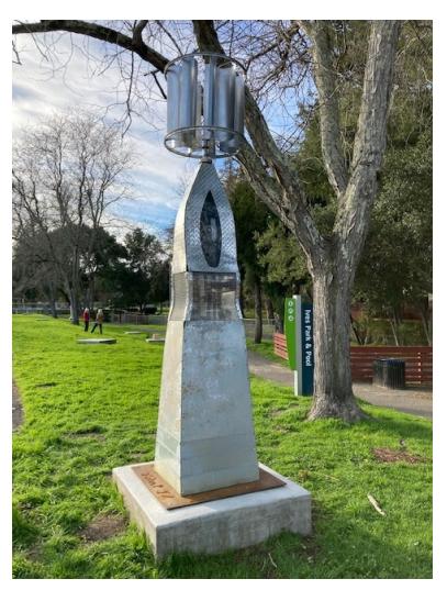
Zephyra Artist: Sculpture Jam