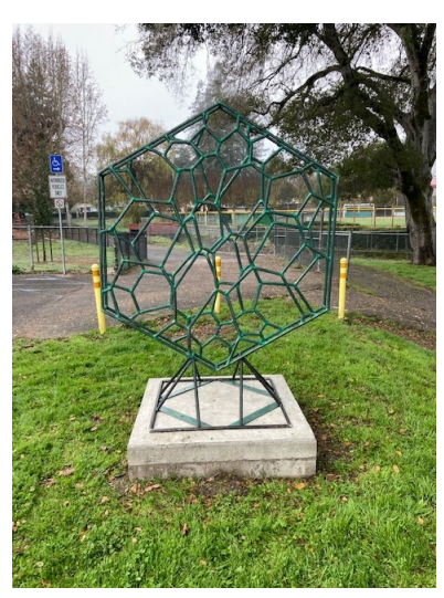
Medallion Artist: Briona Hendren

The Sebastopol City Council and its Public Arts Committee (PAC) invite Sonoma County-based artists to submit proposals for the new Community Sculpture Garden (CSG) located along the pedestrian walk between Ives Park's Calder Creek and the Sebastopol Center for the Arts. The CSG will eventually be comprised of eight sculptures. The first three sculptures were installed in January. Submission information may be found <a href="HERE">HERE</a>. Submissions close April 15.