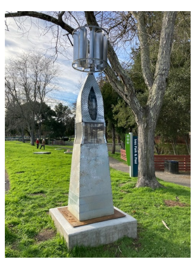
Zephyra Artist: Sculpture Jam