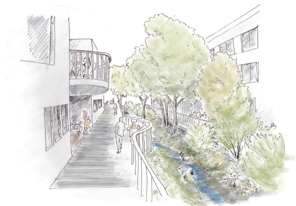
Top: Vision Concept for daylighting Calder Creek between High and S. Main Streets.

Between High and Main Street, these narrow constraints in one area result in cantilevered boardwalks along the edges, with one stretch of boardwalk crossing through the creek corridor. This is to provide support and protection for an existing city sewer main.