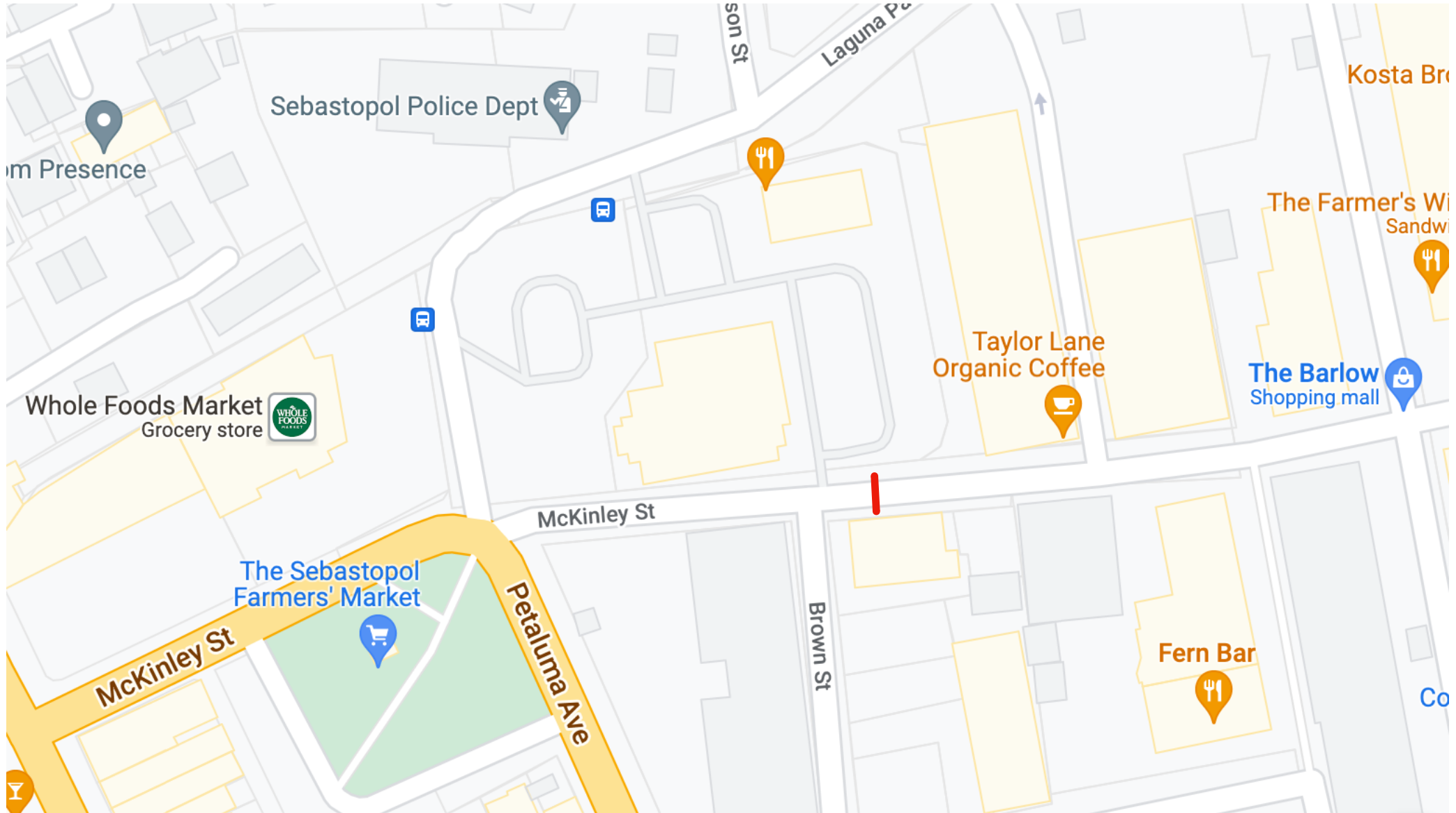
Exhibit A Detour on Brown Street

The red line indicates where The Barlow is willing to install reasonable signage to notify vehicular traffic of the road closure ahead, with an arrow directing them to detour on Brown Street, if required by the City.